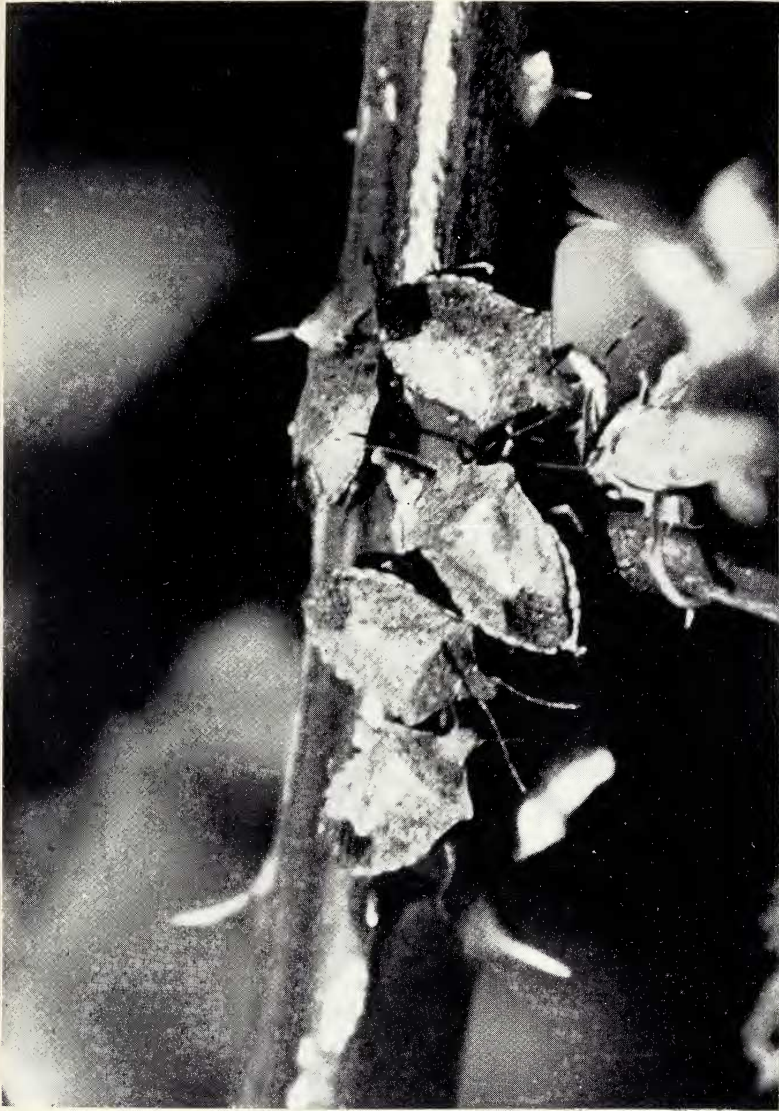
Fig. 4. A group of five stinkbugs in a typical fall cluster on a blackberry stem.